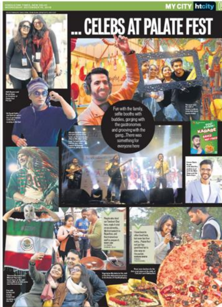
Double Spread HT City 19-Dec-2018