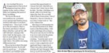
Full Page HT City 15-Dec-2018

Big stars choosing wrong scripts bothers Arshad