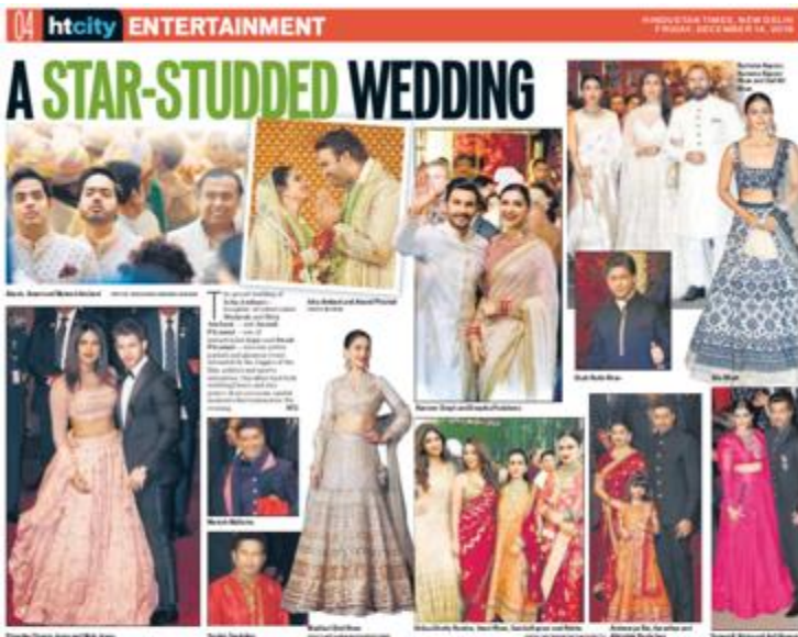
Quarter Page HT City 14-Dec-2018