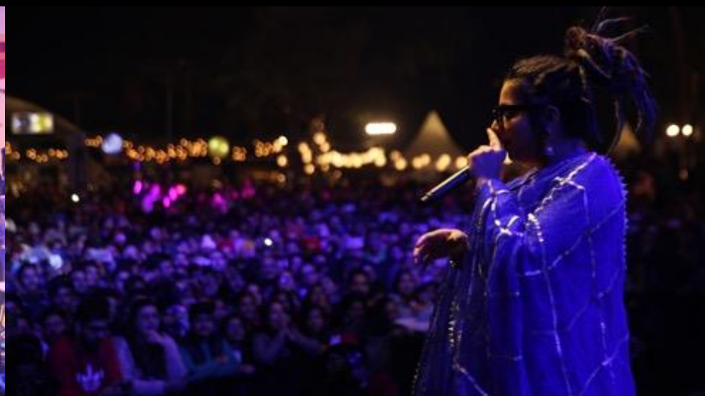
Various genres across 3 day