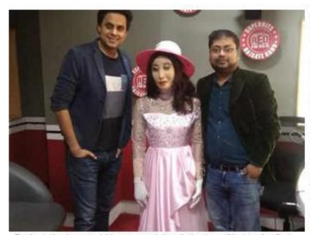
Rashmi, the humanoid has earned the distinction of being the first Radio Jockey who is interacting with callers, and guests.

RANCHI: People in Delhi are interacting these days with a unique voice from Ranchi. The lady named Rashmi was not born but created in Ranchi—She is a humanoid, the first of its kind in the world. Rashmi has earned the distinction of being the first Radio Jockey who is interacting with callers, guests and even giving tips to the listeners—most of whom are awestruck.